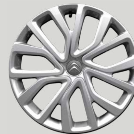
16 inch black steel wheels with full size hub cap