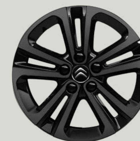
16 inch 'Starlit' black alloy wheels

Optional on Enterprise and Driver. Not compatible with Crew Van or Worksite Pack.