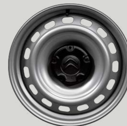
16 inch grey steel wheels with black half hub cap