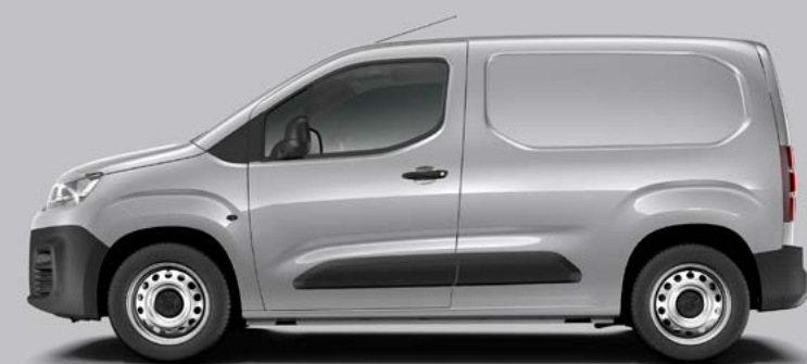
Arctic Steel (SP)*