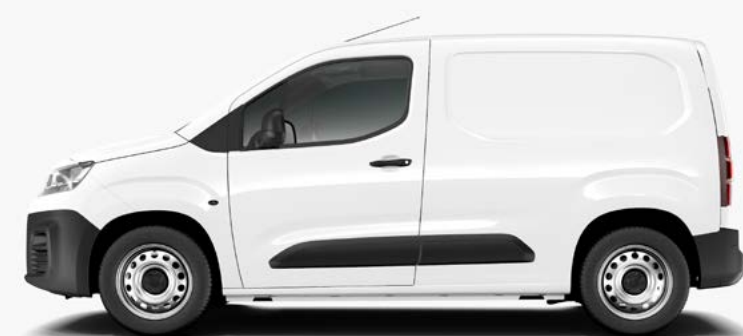
Icy White (F)