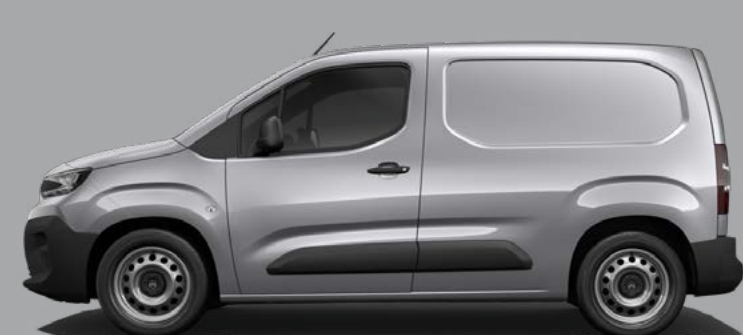
Cumulus Grey (M)