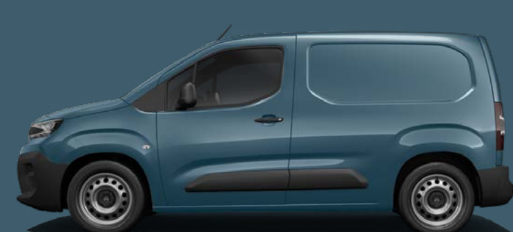
Kiama Blue (M)