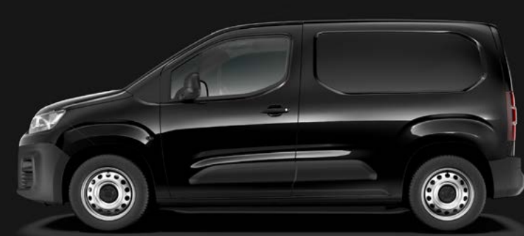
Perla Nera Black (M)